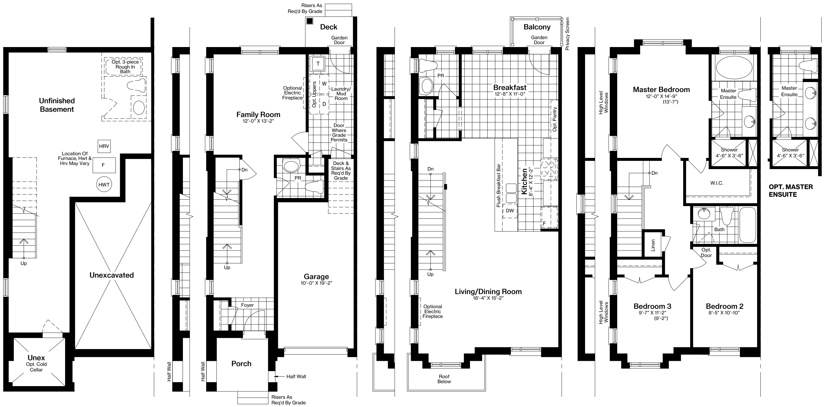
END & CORNER

END ELEVATION A-1= 2,158 sq.ft. | A-2= 2,157 sq.ft. | B-1= 2,165 sq.ft. CORNER ELEVATION A-1= 2,154 sq.ft. | A-2= 2,154 sq.ft. | B-1= 2,161 sq.ft.